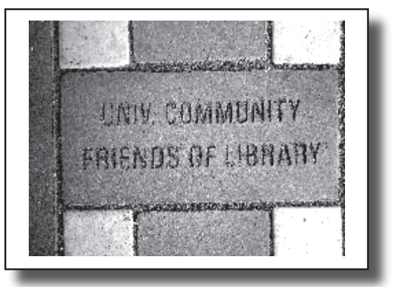
Brick at the new Central Library.

Stories and songs! WEDNESDAYS at 6:30 pm THURSDAYS at 10:30 am