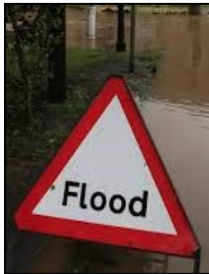
Flooding causes home damage and unsafe driving conditions.

Each year, winter storm flooding threatens San Diego homes and roads, causing expensive repairs and dangerous driving conditions. Fortunately, residents can take steps to reduce damage and drive more safely.