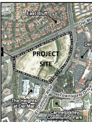
Carmel Valley Community Plan available for public comment

A draft Community Plan Amendment (CPA) for Carmel Valley for the One Paseo project is now available for public review and comment.