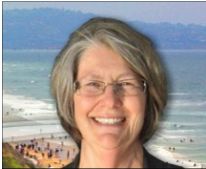
Council President Sherri Lightner — District 1

Twitter: www.twitter.com/#!/SherrriLightner