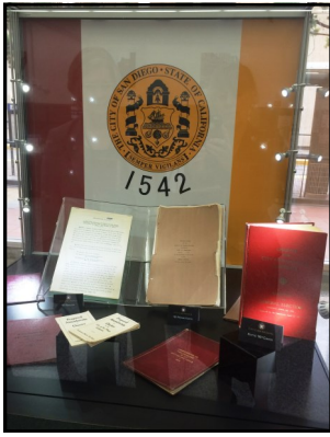
The City's original Charter is on display as part of the City's collection.

At the December 3 meeting, the Committee asked for another preamble draft, approved language for the Planning and Ethics Commissions, and changed the Commission's name to City of San Diego Fair Political Practices Commission. It also asked the Mayor's staff to look into working with the Zoo to leverage the zoological exhibit tax for a general obligation