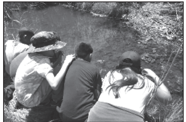
Students from Whitman Elementary in Clairemont look for wildlife in San Clemente Creek in Marian Bear Memorial Park.

This project is part of a comprehensive effort to enhance the Rose Creek Watershed. This visionary planning approach guides projects that help future generations of San Diegans enjoy the watershed's natural beauty, biological diversity and recreational opportunities. You can learn more about this project at www.rosecreekwatershed.org .