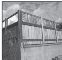
Gates & Fences