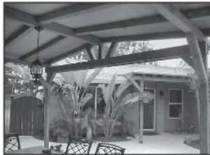
Patios & Decks