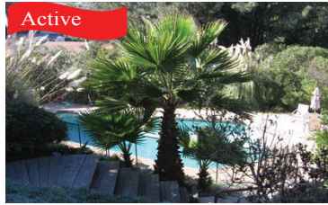
6162 Dunant Street · $689,000