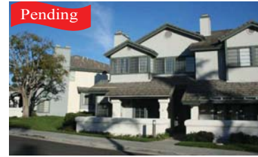
8294 Avenida Navidad, #1 · $539,000

You met the team, now see their results!