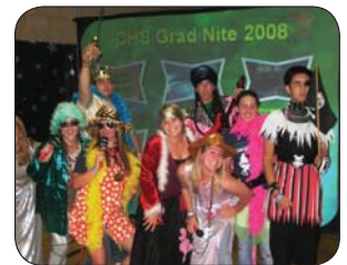
Let's Make a Video from Grad Nite 2008".