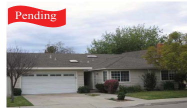
6360 Farley Drive · $675,000