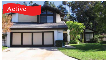
4845 Tula Court · $695,000