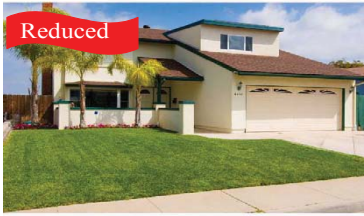
4460 Huggins Street · $699,000