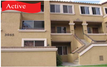
3965 Nobel Drive, # 246 · $350,000