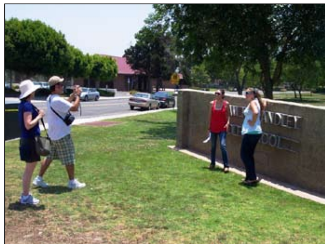
One team helps another team by taking their photo at a clue location

He was an admiral and ambassador to the Soviet Union, but most UC residents are more familiar with the school that is named for him. Take a picture with the sign that lists his middle initial, "H".