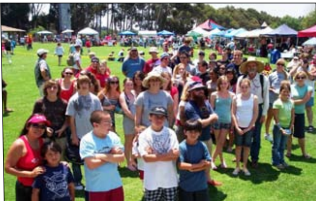
The competitors at the starting line