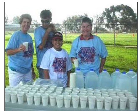
Manning the water station at the 5K race on the 4th.

I appreciate all your efforts in making the 20th UC Celebration the one to remember. That is, until next year!