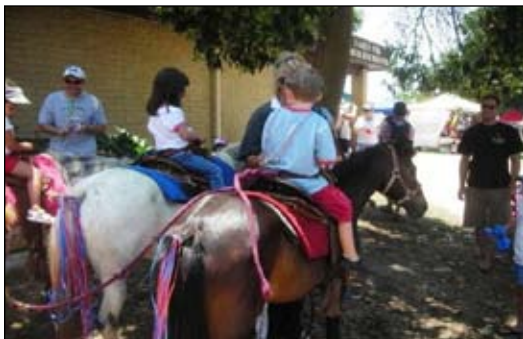
Pony rides for the kids were a big hit!