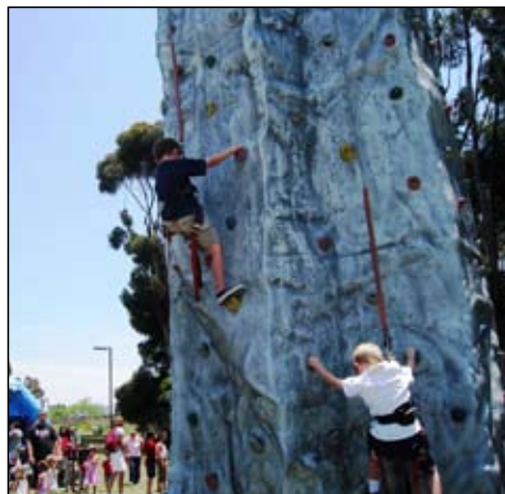
The Climbing Wall provided many hours of enjoyment