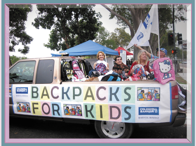
Backpacks for Kids 2011

That Sunday there will be a truck parked at Standley Park between 3:00-7:00 p.m. in which you may donate school supplies for these children in need. So do plan to purchase a backpack, a packet of paper, pencils, socks or other school supplies, drop it by the truck and then stay to enjoy the summer concert featuring the local band, "Relatives, Minors and Friends". For more information contact your local Coldwell Banker agent or call 858-453-6443(HOME).