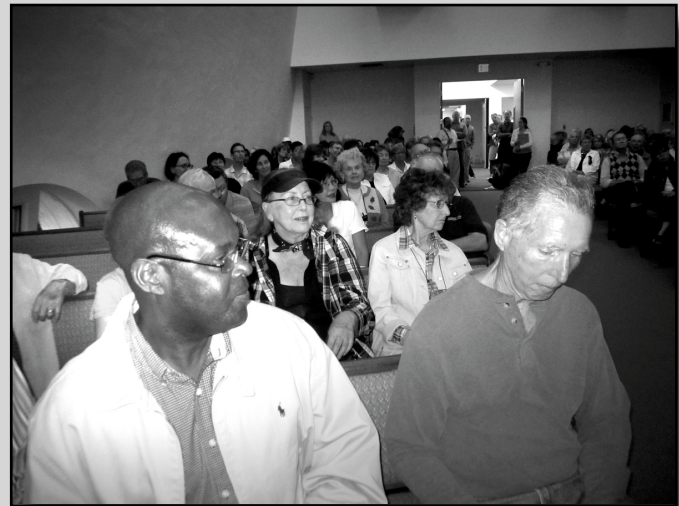
An overflow crowd filled the pews of University City United Church of Christ to learn more about Recovery Homes in UC.