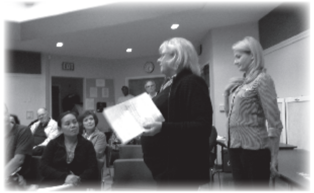
Carl's Jr executives at the recent UCCA meeting.