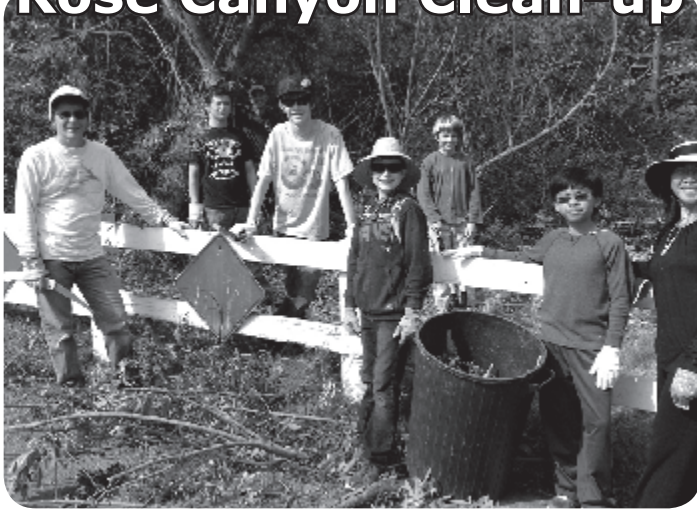
Boy Scout Troop 260 helps with Rose Canyon clean-up.