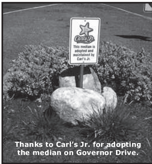
Thanks to Carl's Jr. for adopting the median on Governor Drive.