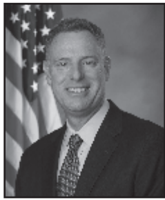
by Scott Peters Congressman, 52nd District