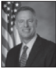
by Scott Peters Congressman, 52nd District