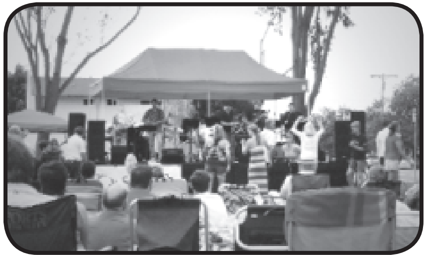
Relative Minors & Friends had a great turn out on Sunday, August 3rd, at the outdoor Summer Concert series on the lawn at Standley Park.