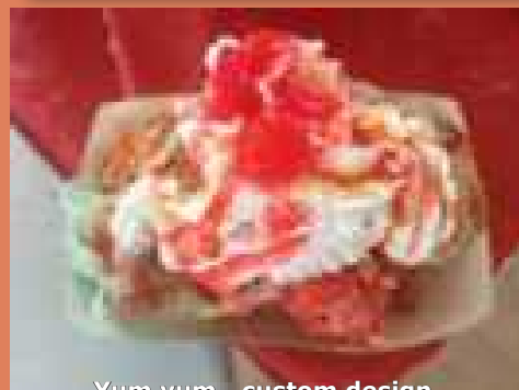
Yum yum...custom design.

You may also join UCCA by going to our website at www.universitycitynews.org .