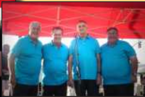
Tuesday Night Alibi provided entertainment.

E ach year the University City Community Association recognizes the hundreds of volunteers that give their time and effort to making our community a place where all feel a part of a large and vibrant neighborhood. The 2014 ceremony was held on Sunday, August 10th, at Standley Park during the concert intermission. This year, UCCA is recognizing the over one hundred people who deliver the UC Newsletter to over 5,000 homes in UC, the 70 individuals who are now Neighborhood Watch captains and our super volunteers who contribute so much of their time for neighborhood: safety, trash pickup, EdUCate, ImproveUC, July 4th Celebration, etc.