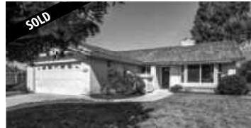
160 Foussat Road, Oceanside