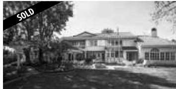
7119 Cather Court University City