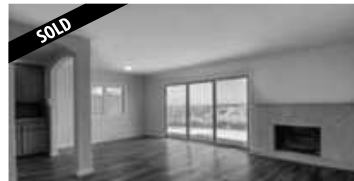
8874 Capceno Road, San Diego