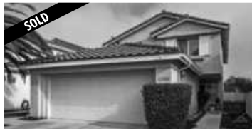
12308 Caminito Mirada, San Diego