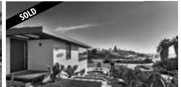
225 4th Street, Encinitas