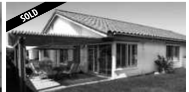
4074 Lemnos, Oceanside