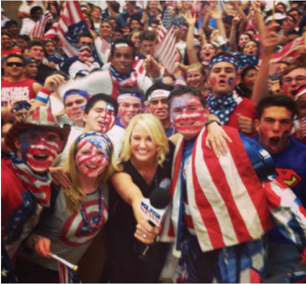
Centurion Students Show Their Spirit