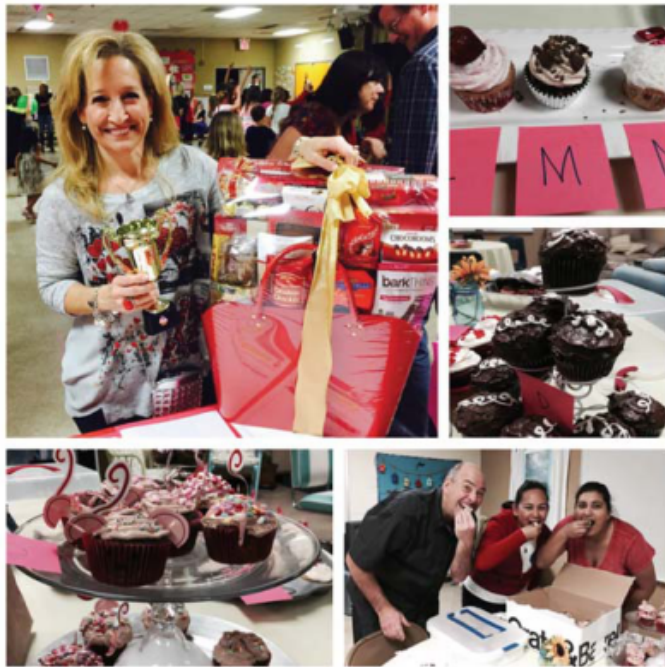
Tasty Showdown at Spreckels