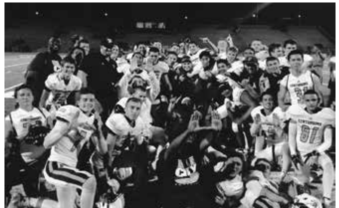
The UCHS varsity football team after their first season game and big win over Del Norte High School on August 28 with a score of 34-14.