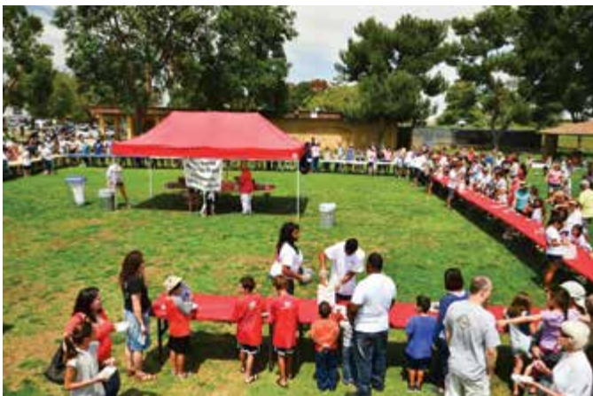
Looks like a beautiful day for ice cream.