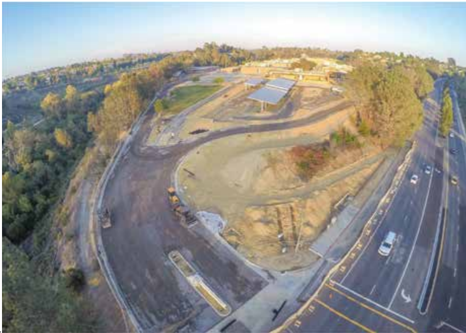
Aerial view of UC High School construction.

Driving up and down along Genesee it is clearly evident that the University City area has become a neighborhood construction zone. And the hammers will continue to be swinging for quite some time, as the University City Planning Group Active Project List currently includes 15 public projects, 20 private projects, and 3 potential projects, including a possible expansion of the Costa Verde Center.