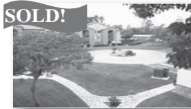
7180 Shoreline # 5302 • $210,000