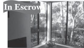
8726 Villa La Jolla #79 • $549,000