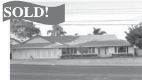
5501 Sandburg Ave • $989,000

Save the Date! April 23rd for our Annual Shredfest.