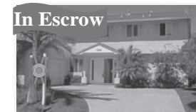
3246 Wellesly Ave • $855,000