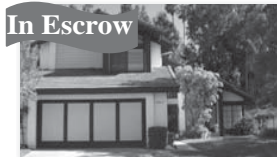
6864 Radcliffe Dr • $539,000