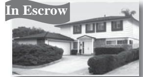
3393 Mercer Lane • $749,000

UCAGENTS.COM OUR COMMUNITY • OUR COMMITMENT