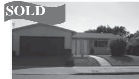
4621 Murphy Ave. • $525,000