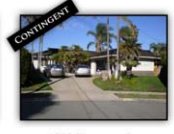
6059 TULANE ST. 4BR/2BA 1500 SF CUL-DE-SAC LOCATION, POOL! $515,000