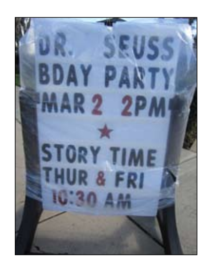
U.C. Library sign advertising activities is covered by plastic to protect it from February rains.