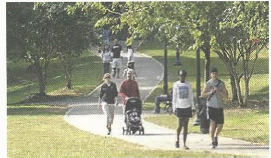
FUTURE WALKING PATH