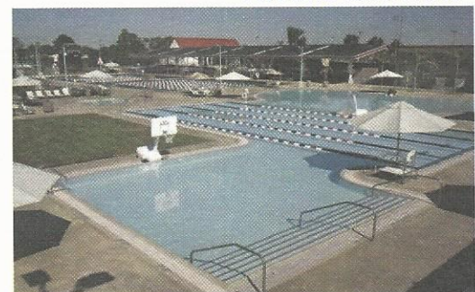
FUTURE AQUATIC CENTER