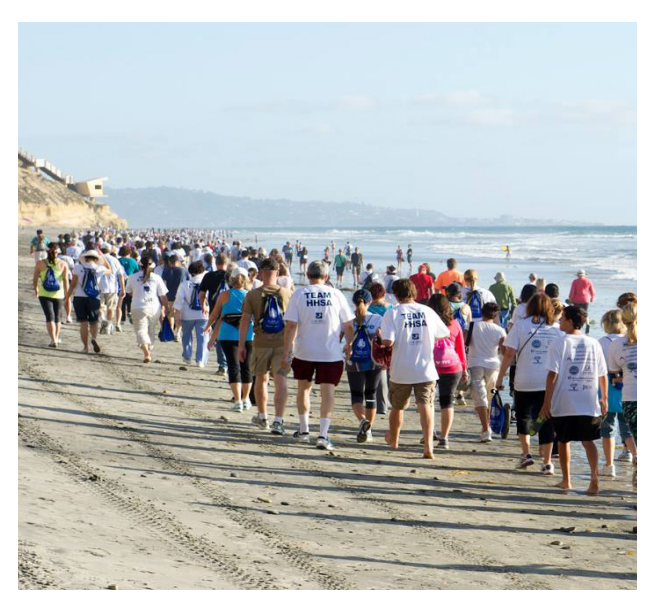
San Diego County Medical Society