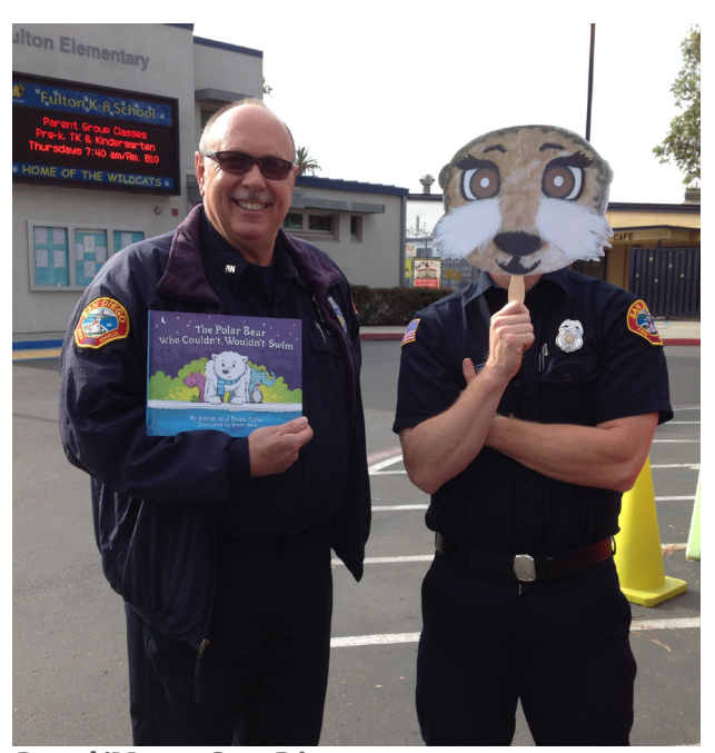
Rural/Metro San Diego

"Because the Y is for everyone, we bring together children, adults and families of all abilities like no other organization can. As a result, San Diego County residents are receiving the tools needed to achieve greater health and well-being for their spirit, mind and body. We want to be a place where everyone in San Diego County can work on living a healthy life."