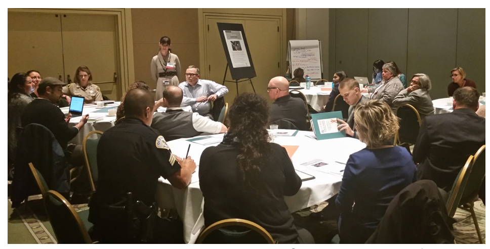
North County Community Forum

The Live Well San Diego Central Region Leadership Team Summit engaged the many Live Well San Diego partners, community-serving