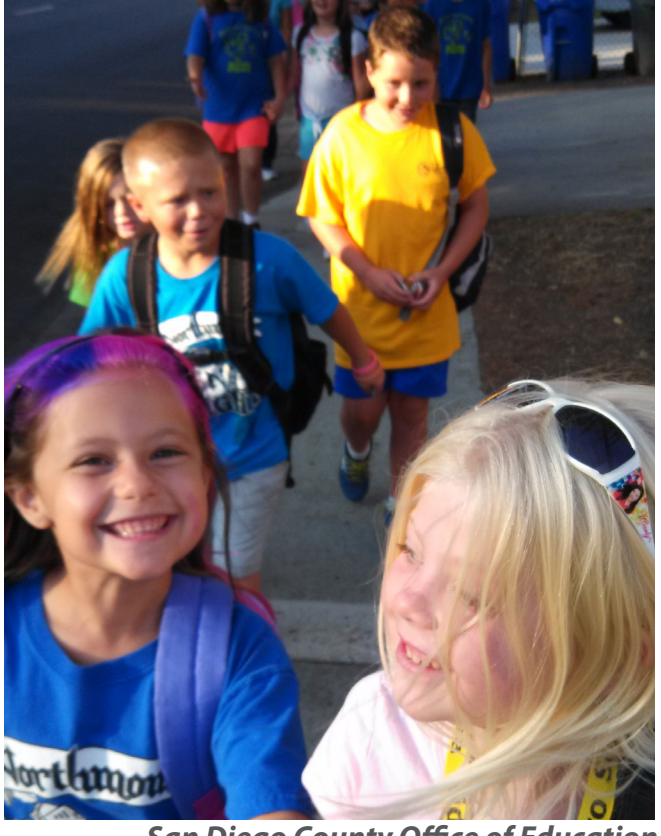
San Diego County Office of Education

Additional partners who provide health care or other services also host community wellness events throughout the year. The Community Research Foundation provides year-round wellness education and resources to persons recovering from mental illness or substance abuse issues. At its first annual Wellness Fair, more than 100 clients from throughout San Diego