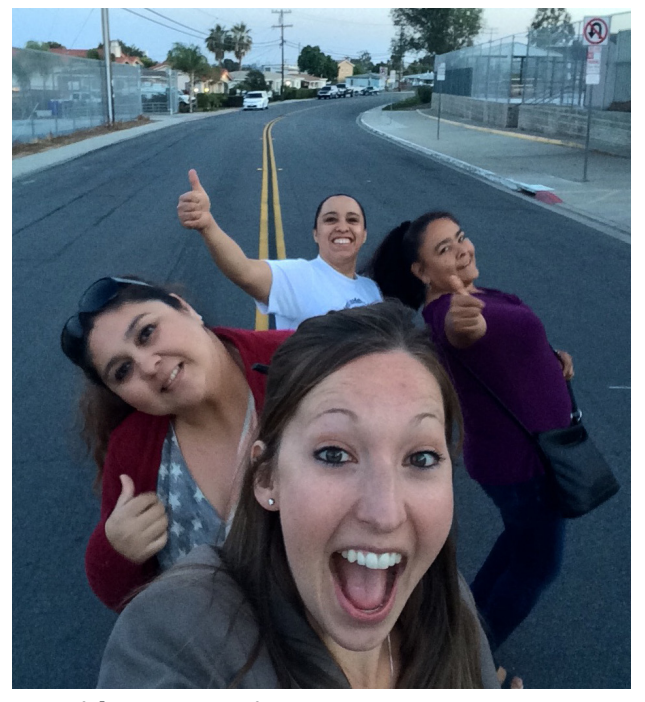
Bayside Community Center

For example, the Linda Vista Resident Leaders in Action collected community input on the need for increased lighting in a neighborhood park, presented the results to the City Council, and navigated through the bureaucratic process to ultimately get the project in the latest budget. Increased lighting will not only address the safety concerns in the park after dark but also enrich the neighborhood by providing more access to recreational and community space for families, friends and neighborhood kids. Similarly, community gardens present opportunities for local commerce and giving back. The Linda Vista Resident Leaders' Community Garden at Bayside Community Center addresses the community's food desert by providing fresh, healthy and affordable food and