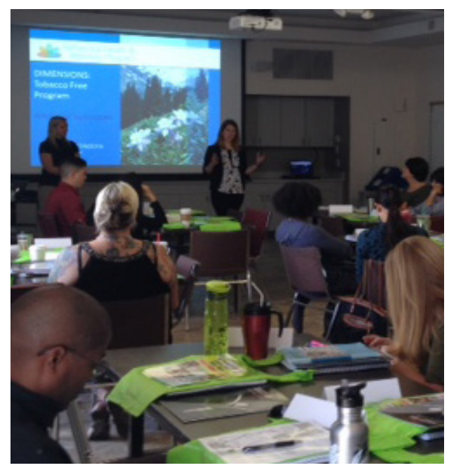
American Lung Association & CVS Health