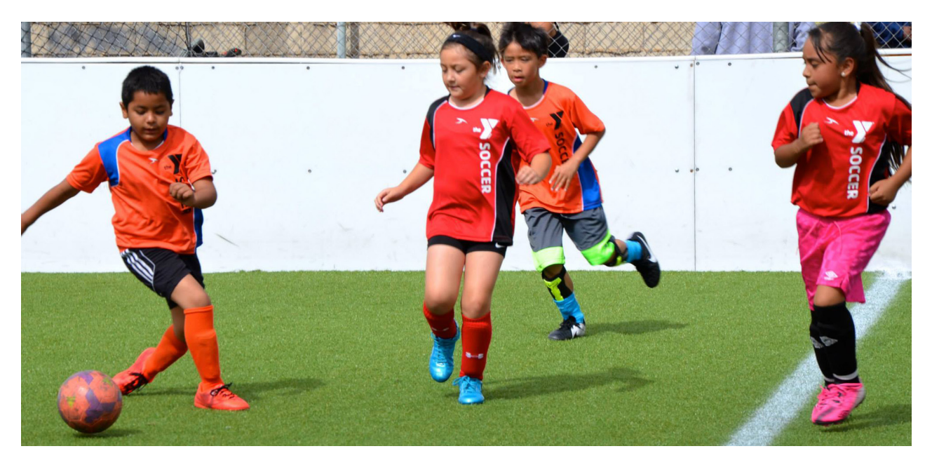
YMCA of San Diego County

Given San Diego's mild, sunny climate, swimming can be a year round activity and water safety knowledge is especially important. Rural/Metro San Diego provides a wide array of education programs, including drowning prevention programs, throughout the spring and summer months. In May, firefighters, lifeguards and Sea World EMTs joined Rural/Metro to read elementary school students specially designed books about water safety. They reached about 1,000 students, primarily kindergartners, in San Diego public schools. That same month, the City of Chula Vista opened its summer swim program, which provides free swim lessons for over 1,200 students. The YMCA of San Diego County also offers swimming lessons, as well as many other programs and activities for health, wellness and learning that cater to individuals and families ranging from infants to seniors.