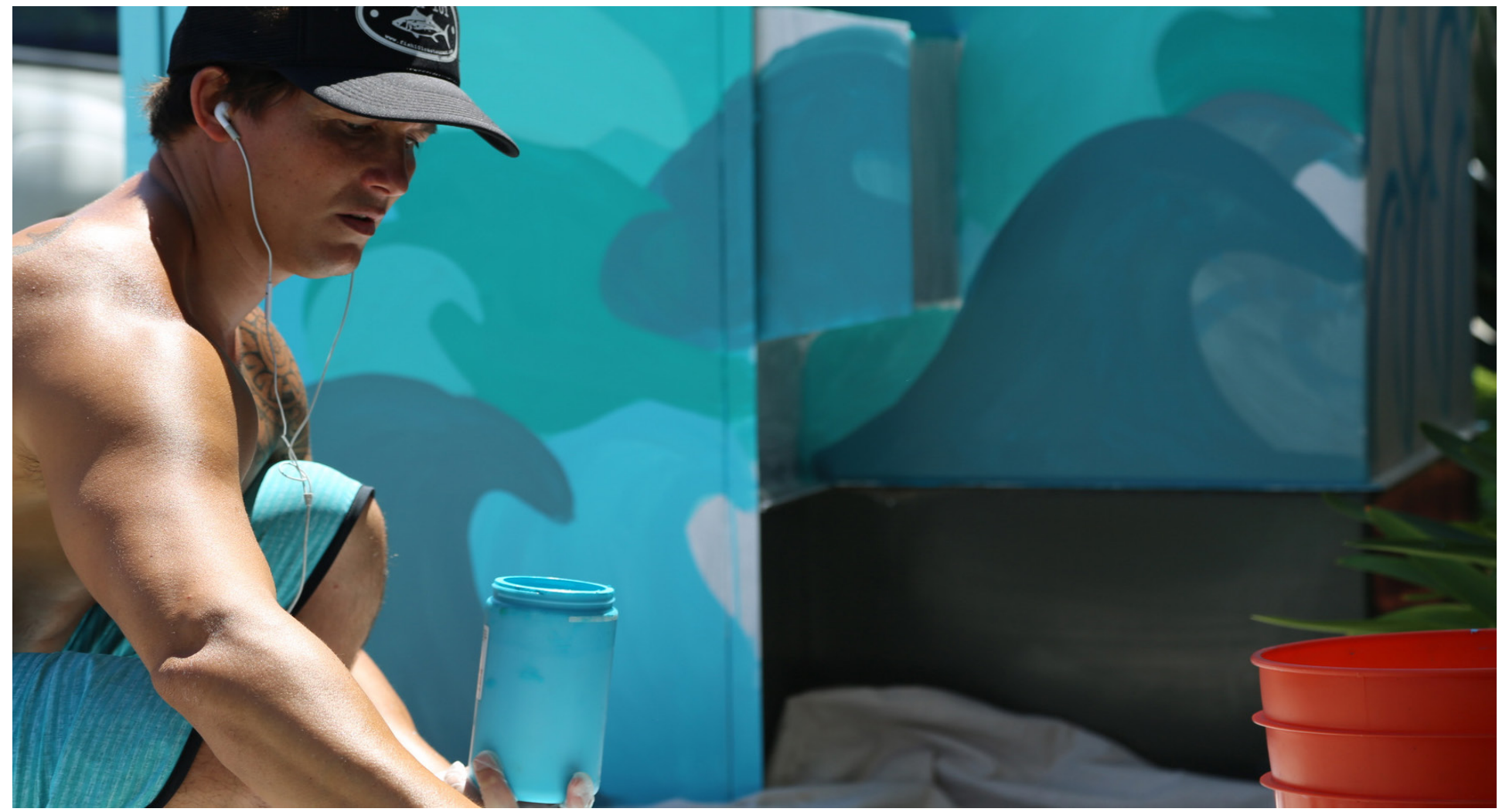
Leucadia, Cardiff and Encinitas 101 Main Street Associations and SDG&E

A clean and safe community also benefits from being an attractive, beautiful community. Three Live Well San Diego partners, Leucadia 101 Main Street Association, Cardiff 101 Main Street Association and Encinitas 101 Main Street Association partnered together to provide nine new pieces of public art along the coast in Encinitas. The "Utility of Art" project enhances the coastal corridor by creating a public art gallery that visually represents the culture of Leucadia, Cardiff and Downtown Encinitas. All three Main Street programs have also collaborated by selecting artists to paint San Diego Gas & Electric electrical boxes located along the corridor.