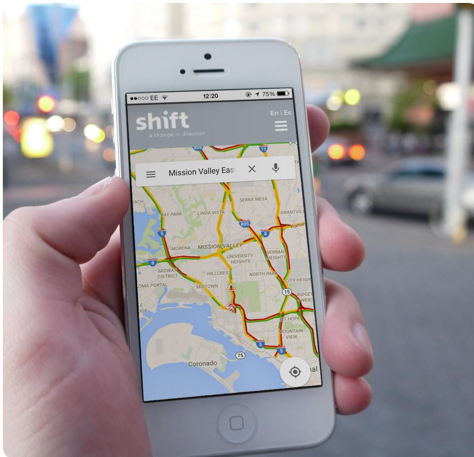
Access real-time traffic on ShiftSanDiego.com

Learn more about vanpooling and other transportation resources at: ShiftSanDiego.com/GoldenTriangleCommuter