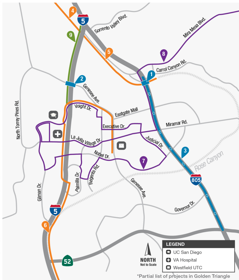
Golden Triangle Area Improvements Map