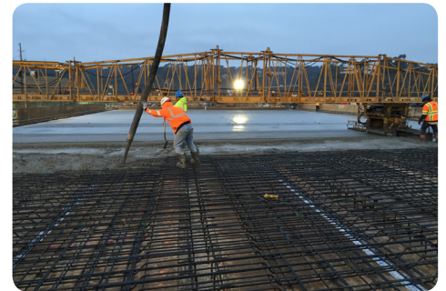
Crews pour concrete to create the new bridge deck

Sign up for project emails here . Access more project info, a weekly list of planned closures, and the project webcam at KeepSanDiegoMoving.com/Genesee