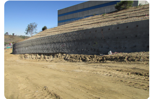
A new retaining wall being built along the northbound on-ramp