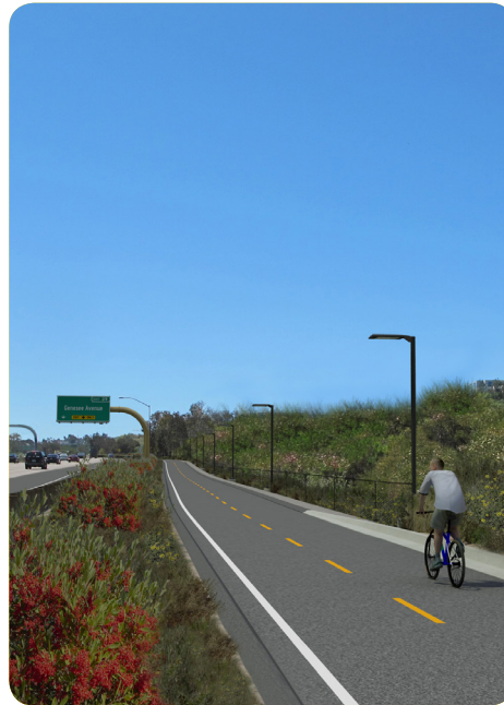
Artistic rendering of new bike path; connecting the first and last mile of a commute and place of employment

The path will improve an important connection between the Sorrento Valley COASTER Station and a large number of employers in the Torrey Pines and Golden Triangle area. This unique addition will support the future North Coast Corridor bike network, provide alternative transportation choices, and encourage more people to #GObyBIKE.