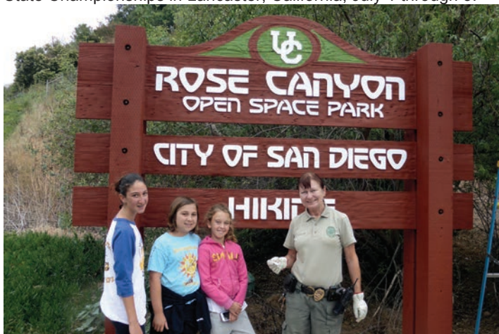
Girl Scouts Refresh Rose Canyon Open Space Park Sign

Both UC Del Sol 10U and 12U teams later went on to win the District Championships. Good luck to the girls as they head for the State Championships in Lancaster, California, July 1 through 3.