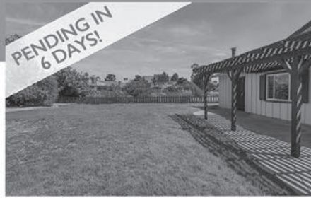
PENDING IN 6 DAYS! 2982 Renault Place - Listed for $875,000 4 BEDROOMS | 2 BATHROOMS | 1,858 SQFT 8,800 SQFT LOT | WEST END | CUL-DE-SAC