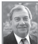
Youth Sports Coach for 25 Years

Thank you for your loyalty. We appreciate you.