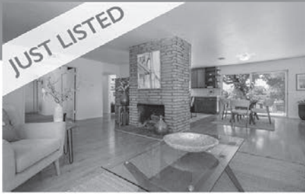
JUST LISTED 5852 Stadium St - Listed for $899,000 4 BEDROOMS | 2 BATHROOMS | 1,554 SQFT QUIET CANYON LOT