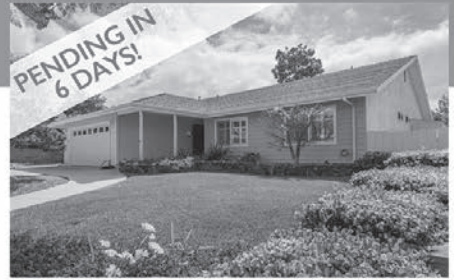
PENDING IN 6 DAYS! 6766 Edmonton Ave - Listed for $879,000 3 BEDROOMS | 2 BATHROOMS | 1,672 SQFT BEAUTIFULLY REMODELED | CURIE SCHOOL

Thinking of Selling? Contact me today to see what I do differently to achieve the greatest possible value for your home.