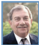
Youth Sports Coach for 25 Years

Thank you for your loyalty. We appreciate you.