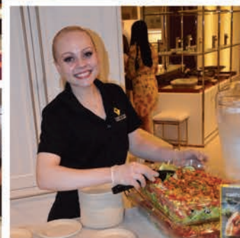
Tastes were provided by restaurants above, clockwise: Lorna's Italian Kitchen, California Pizza Kitchen, Farmer's Table, Snooze, and sharing a kitchen Ahaarn and French Gourmet. Below: Everyone having a great time.