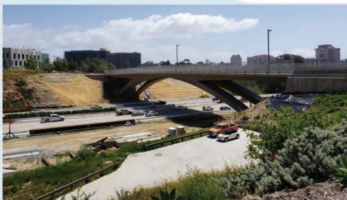
Work beneath the Gilman Drive Bridge is underway.

Mid-Coast Trolley along Genesee Avenue, SANDAG Project: Falsework is being dropped along the Genesee viaduct, moving from north (Campus Point Drive) to south (UTC Terminus). This process is anticipated to run through the end of 2019. Ongoing overnight closures along Genesee Avenue are being implemented to drop falsework, begin repaving and restripe vehicle lanes. Available closure updates can be found at ShiftSanDiego.com/Notices .