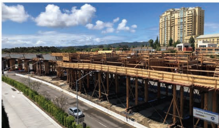
Falsework removal along the Genesee viaduct will begin in the north and move south to UTC Terminus

Pure Water Phase 1, City of San Diego Project: Construction on Phase 1 of the Pure Water project is anticipated to begin later this year. This summer, initial site work and grading will take place at the North City Pure Water Facility and the North City Water Reclamation Plant. A Pure Water Day Open House will take place at the North City Water Reclamation Plant, located at 4949 Eastgate Mall in San Diego on Saturday, June 22, from 10:00am to 3:00pm. The open house will include tours of the Pure Water Demonstration Facility, informational booths about the Phase 1 projects and family-friendly activities, including tasting the purified water, taking home a succulent, and a kids zone with an obstacle course and scavenger hunt. RSVP by Saturday, June 15 to confirm your tour spot at tours.purewatersd.org .