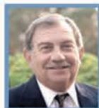
Youth Sports Coach for 25 Years

Thank you for your loyalty. We appreciate you.