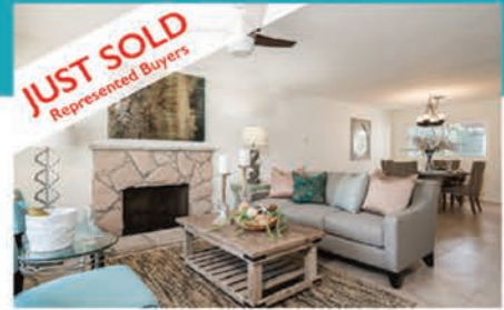
4460 Huggins Street - Sold for $915,000 4 BEDROOMS | 2.5 BATHROOMS | 2,742 SQFT UPDATED HOME WITH ENTERTAINER'S BACKYARD

Thinking of Selling? Contact me today to see what I do differently to achieve the greatest possible value for your home.