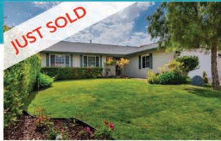
5853 Haber Street - Sold for $891,000 4 BEDROOMS | 2 BATHROOMS | 1,464 SQFT "PICTURE PERFECT" SINGLE STORY HOME