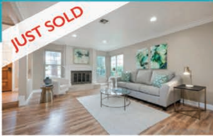
3375 Willard Street - Sold for $1,050,000 4 BEDROOMS | 2.5 BATHROOMS | 2,396 SQFT BEAUTIFULLY REMODELED 2-STORY HOME