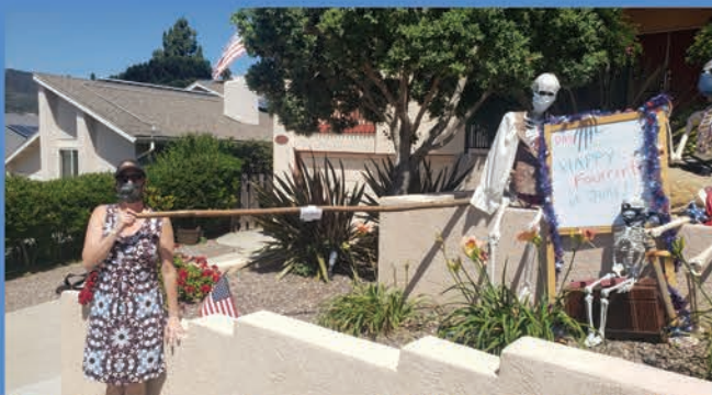
Team Pirate shows how to socially distance during the UC Celebration Virtual Photo Scavenger Hunt