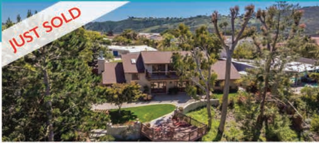
2538 Quidde Avenue - Sold for $1,325,000

Stay healthy during these unprecedented times!