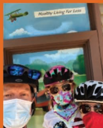
The Hillberry Team discovers the biplane mural by Sprouts.