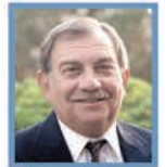
Youth Sports Coach for 25 Years