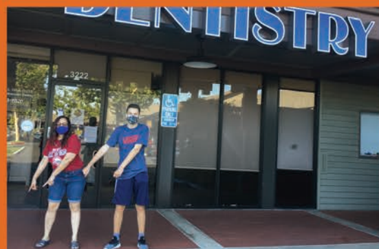
Team Valomans finds a place that offers braces, while doing a dance (?) appropriate to the location.