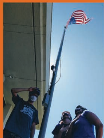
The Morch Family salutes the flag.