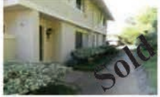
8036 Camino Tranquilo 3 Bedrooms / 2.5 Baths, 1342 SF Offered @ $615,000