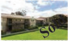
7405 Charmant #2327 2 Bedrooms / 2 Baths, 934 SF Offered @ $499,000

"The American Dream Makers" Do It Again! Listed &/or Sold In UC By Caryl & Linda