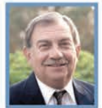
Youth Sports Coach for 25 Years

Thank you for your loyalty. We appreciate you.