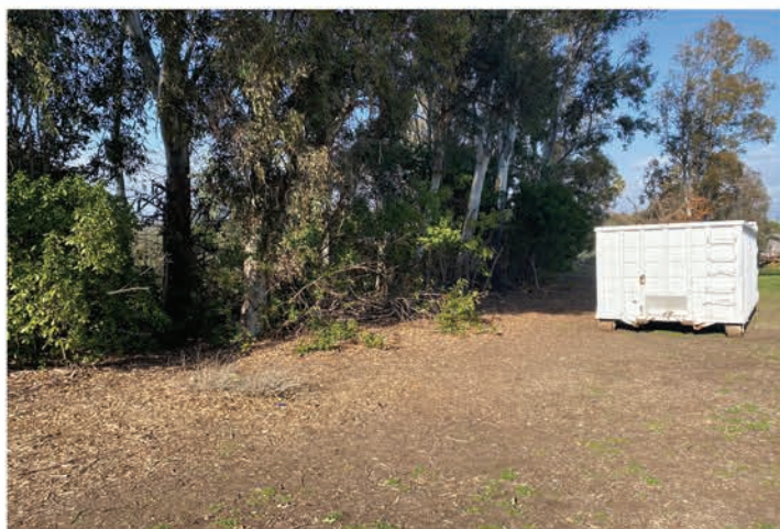
Photo of completed park clean-up