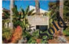
6275 Caminito Araya 1 Bedroom / 1 Bath, 868 SF Offered @ $412,000