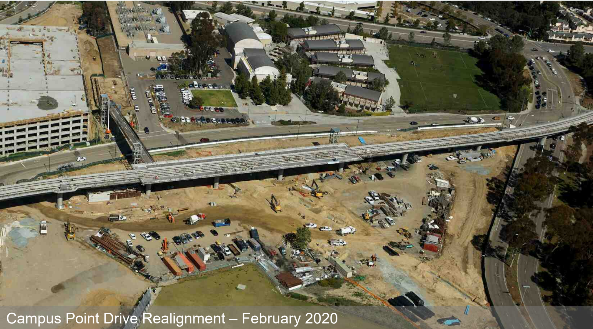
Campus Point Drive Realignment – February 2020