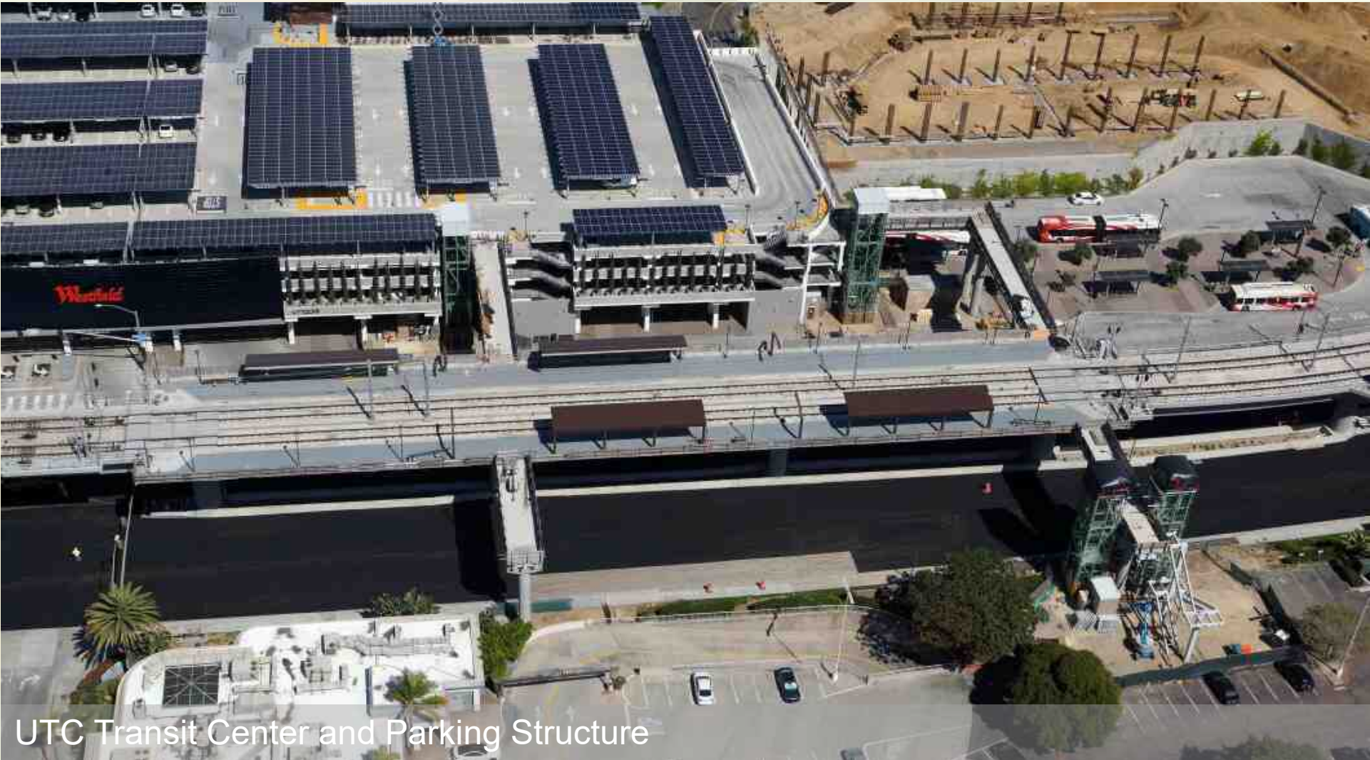
UTC Transit Center and Parking Structure