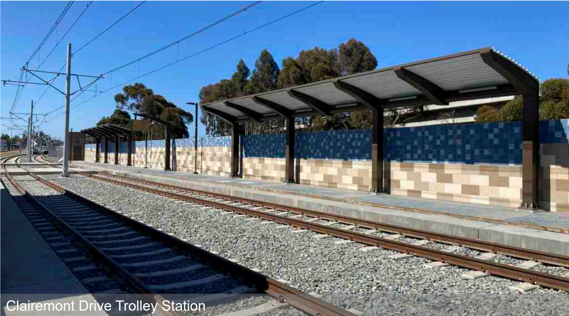
Clairemont Drive Trolley Station