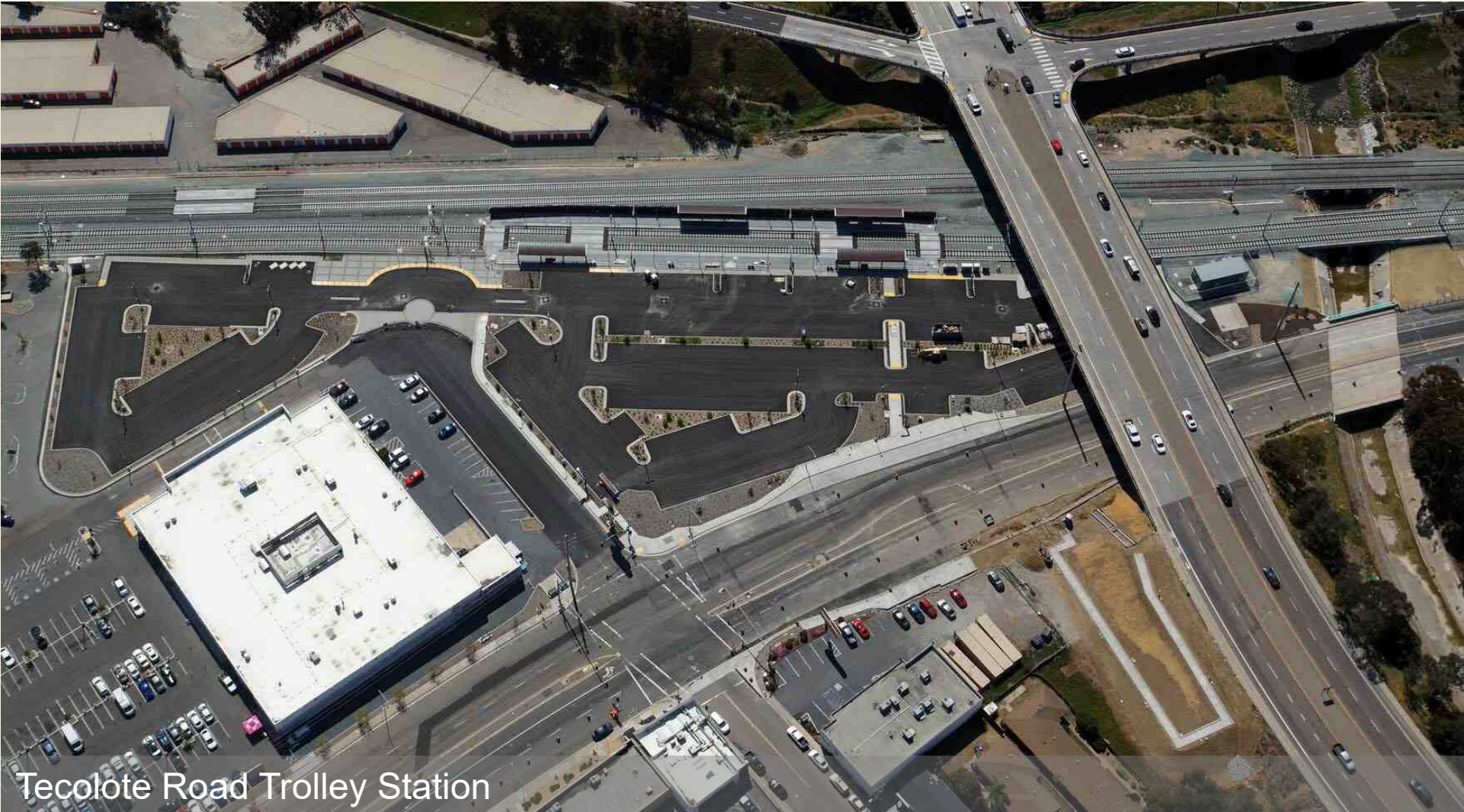
Tecolote Road Trolley Station