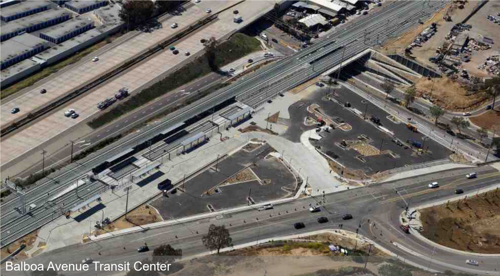
Balboa Avenue Transit Center