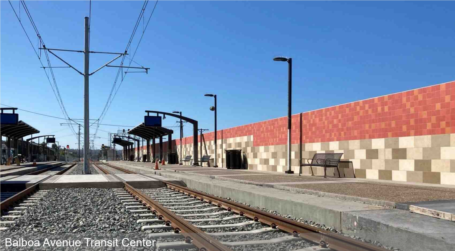
Balboa Avenue Transit Center