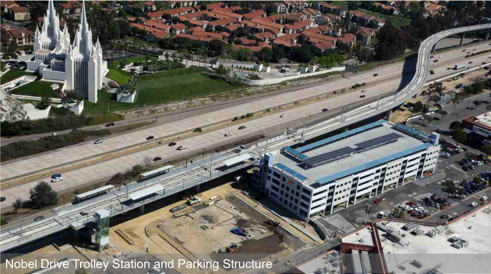
Nobel Drive Trolley Station and Parking Structure