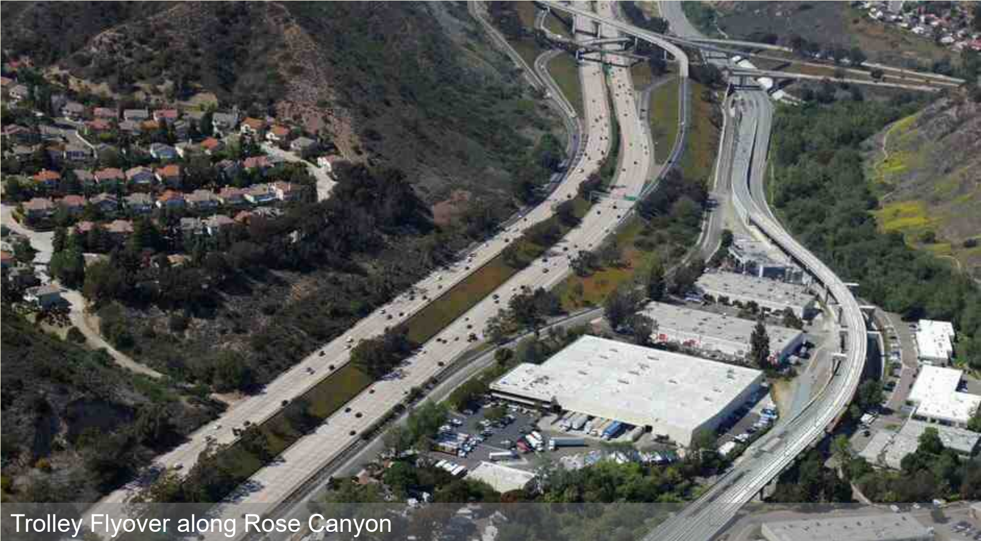
Trolley Flyover along Rose Canyon