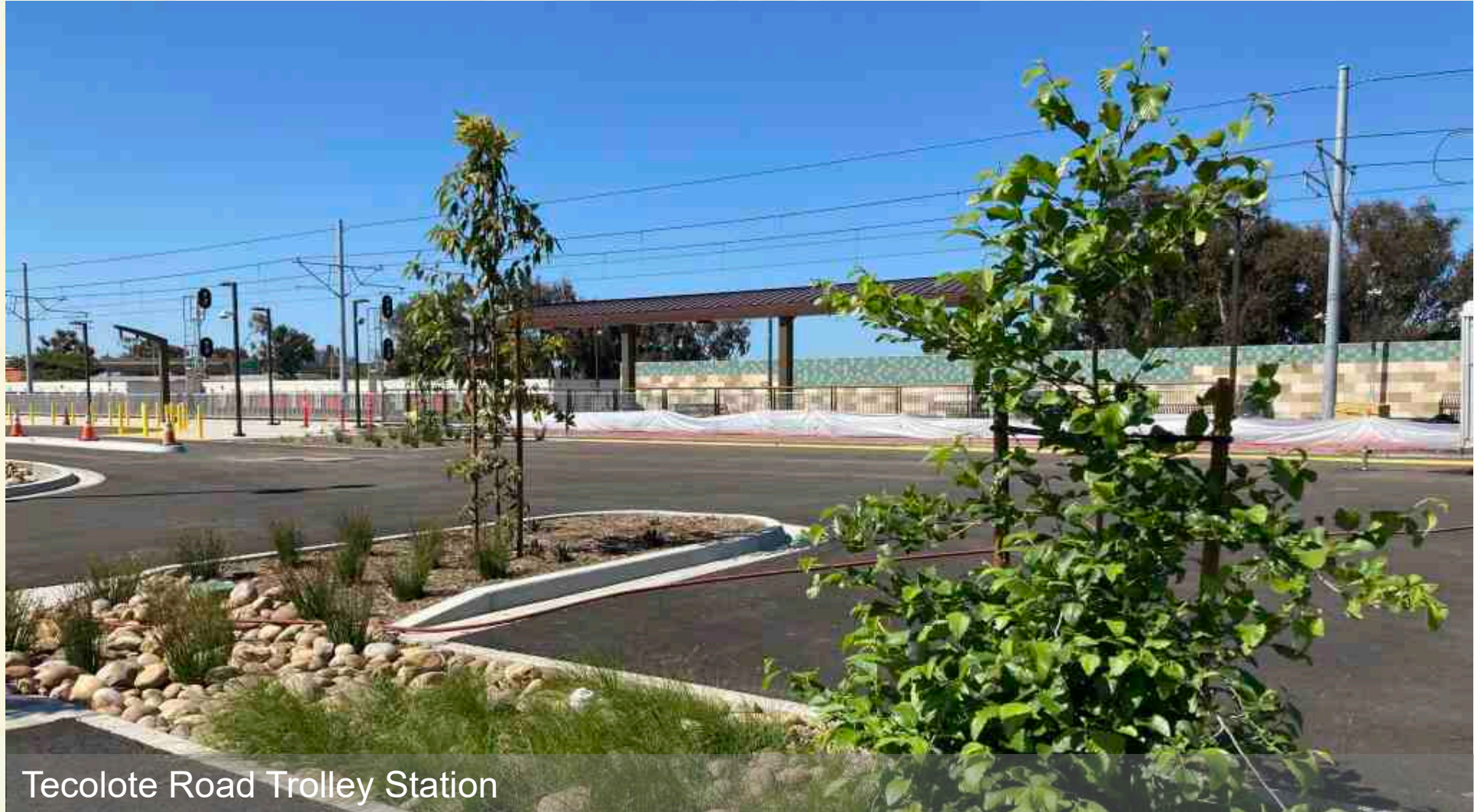
Tecolote Road Trolley Station