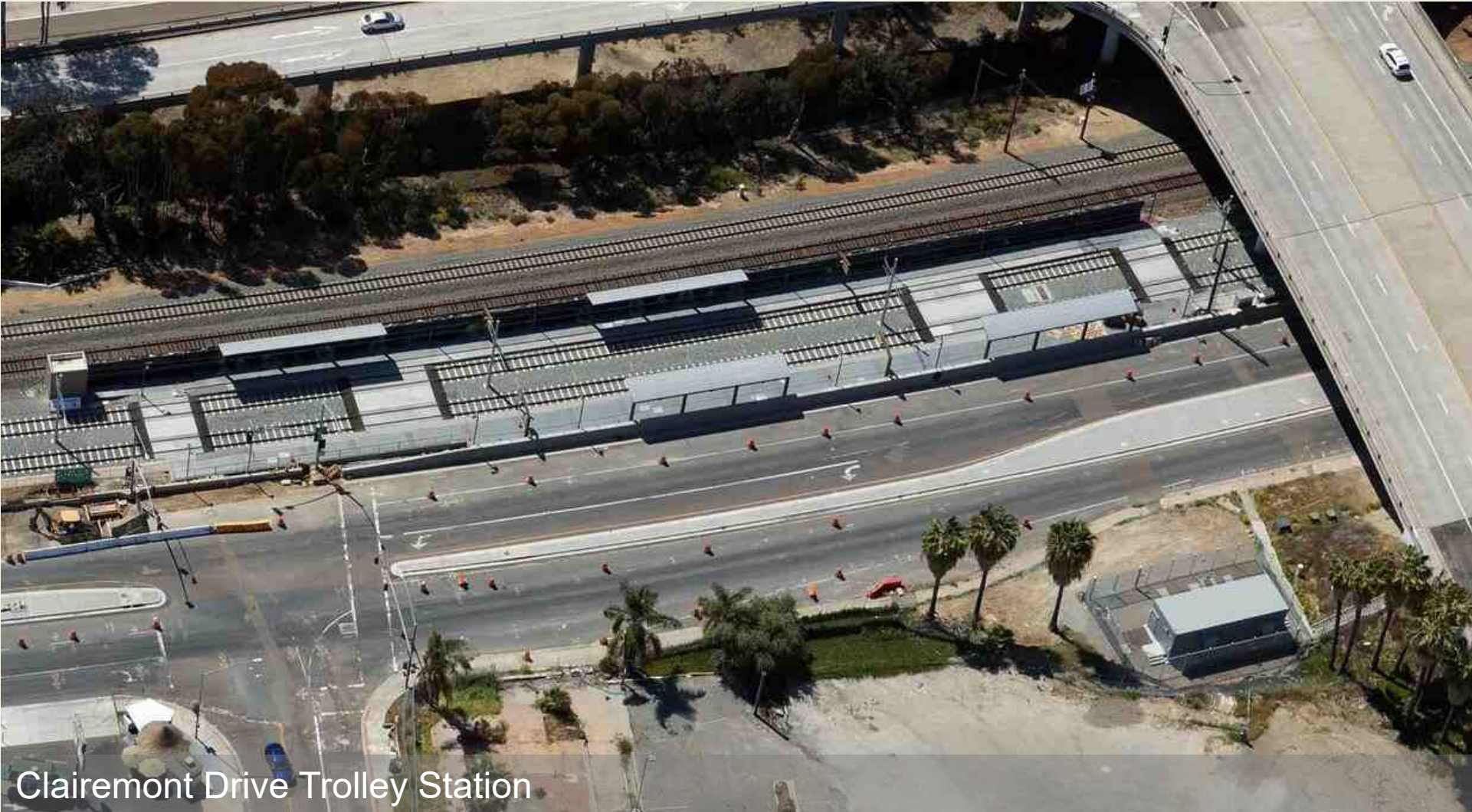
Clairemont Drive Trolley Station