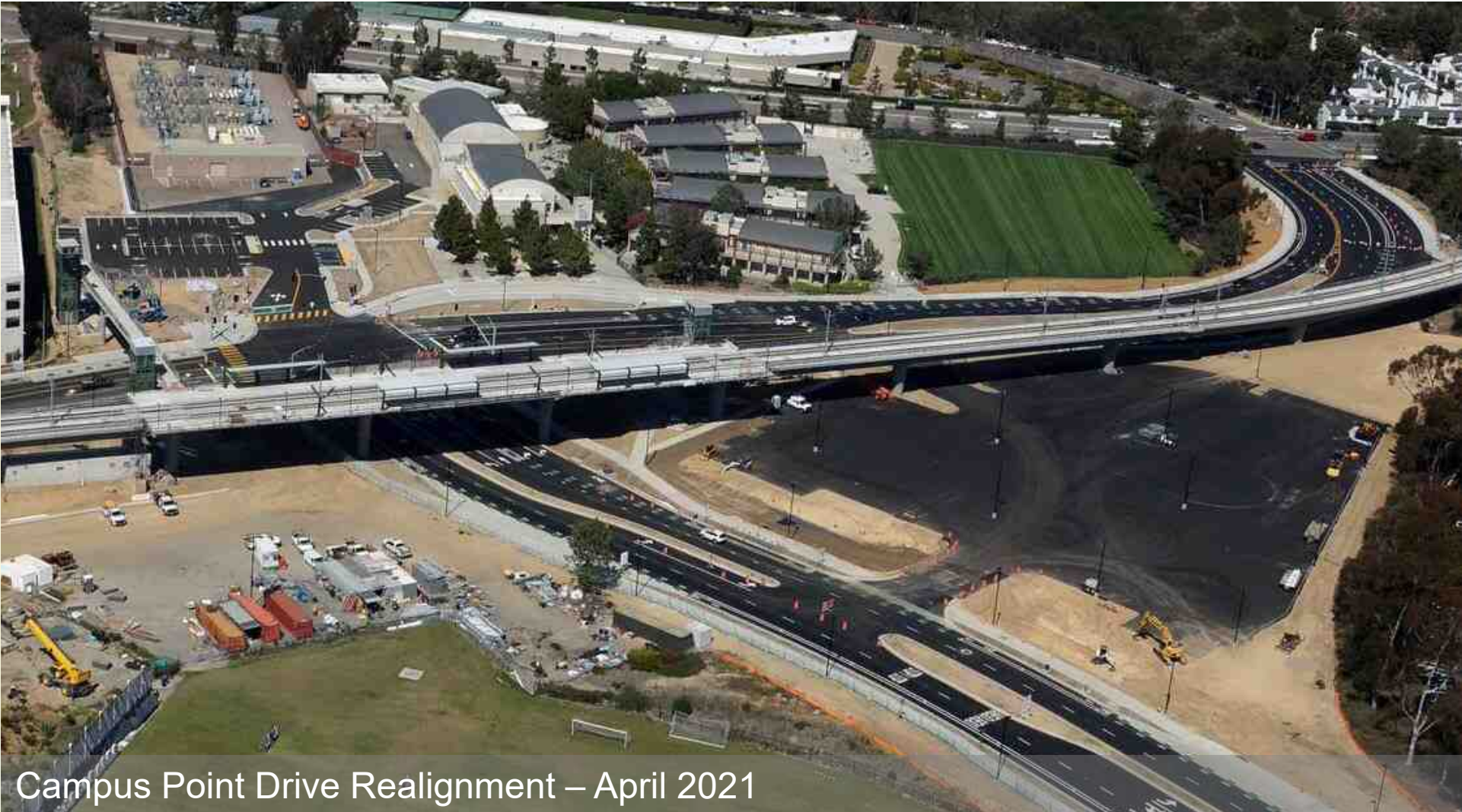
Campus Point Drive Realignment – April 2021