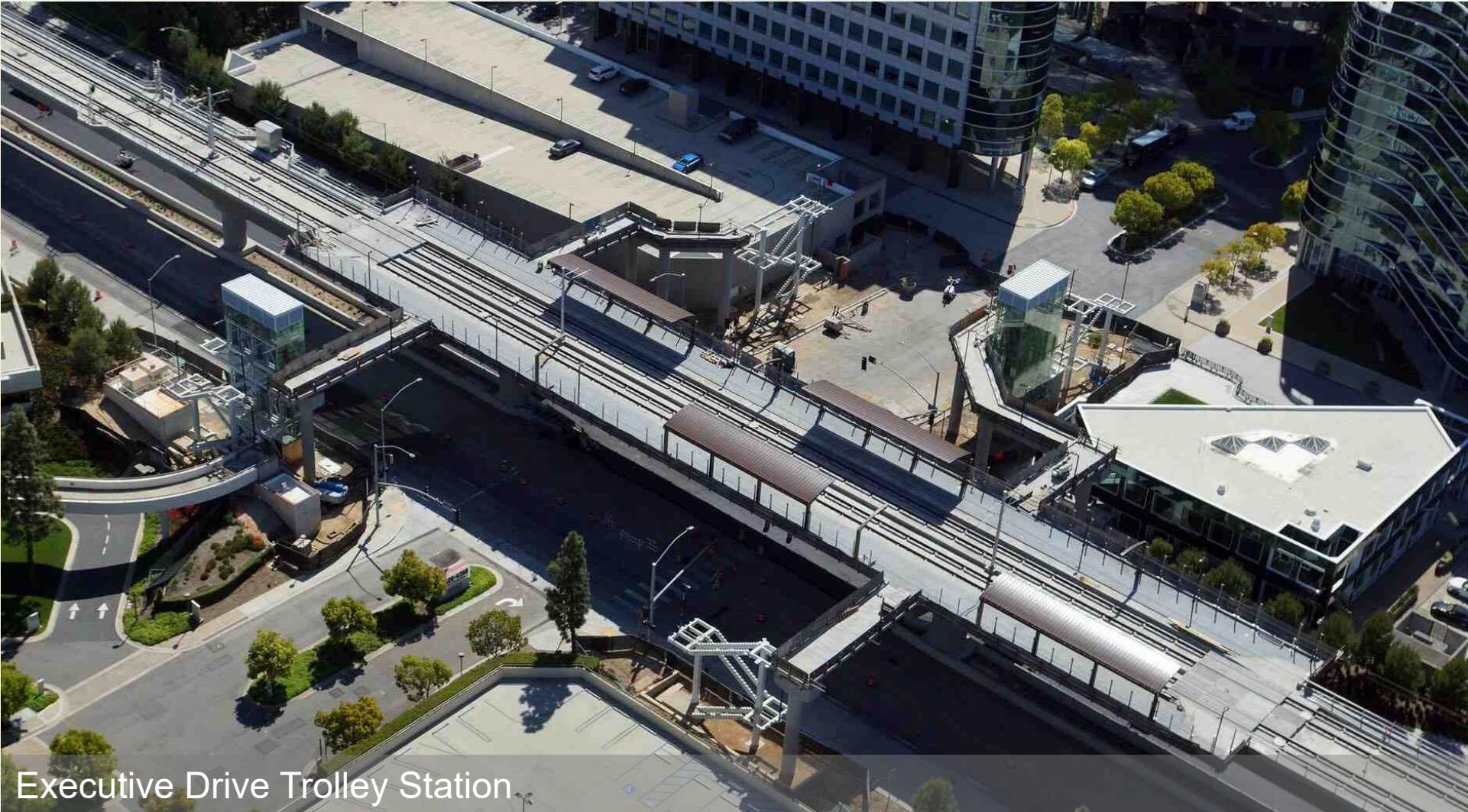
Executive Drive Trolley Station