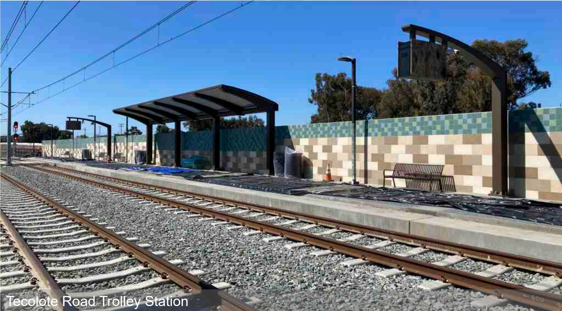
Tecolote Road Trolley Station