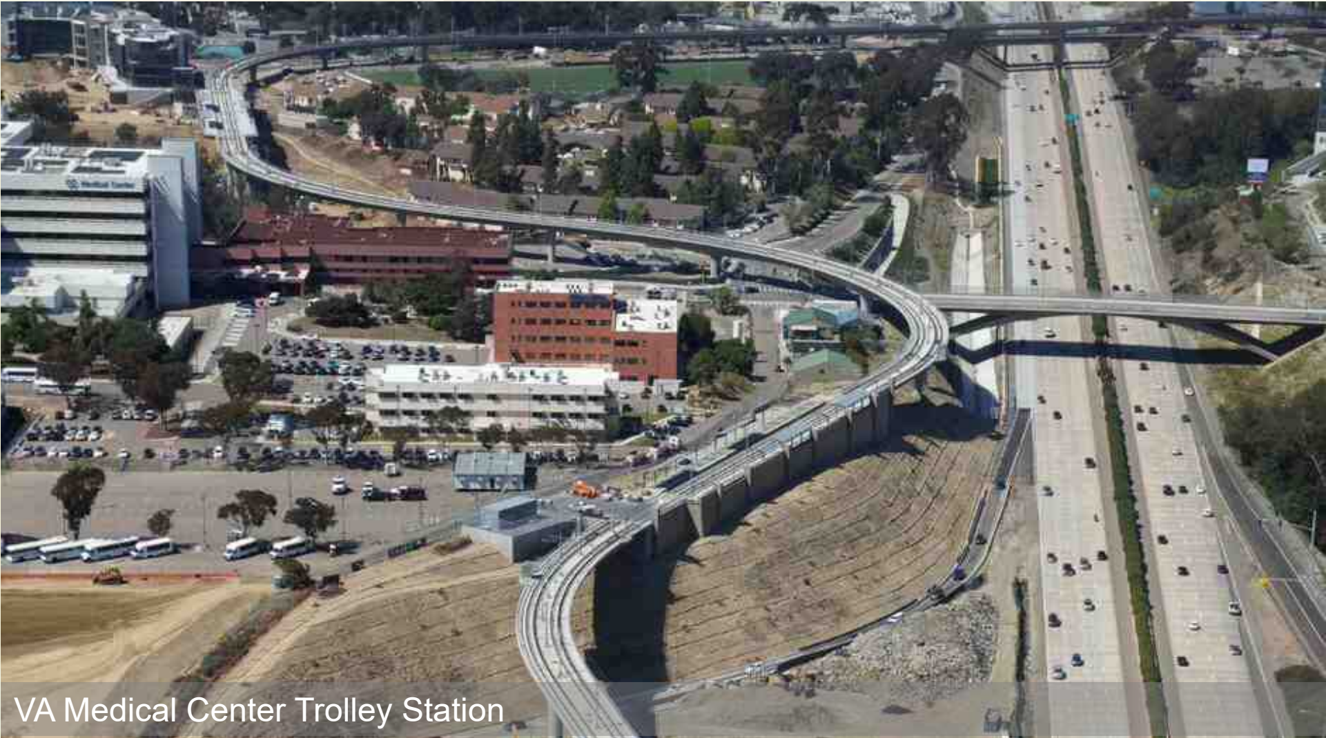
VA Medical Center Trolley Station