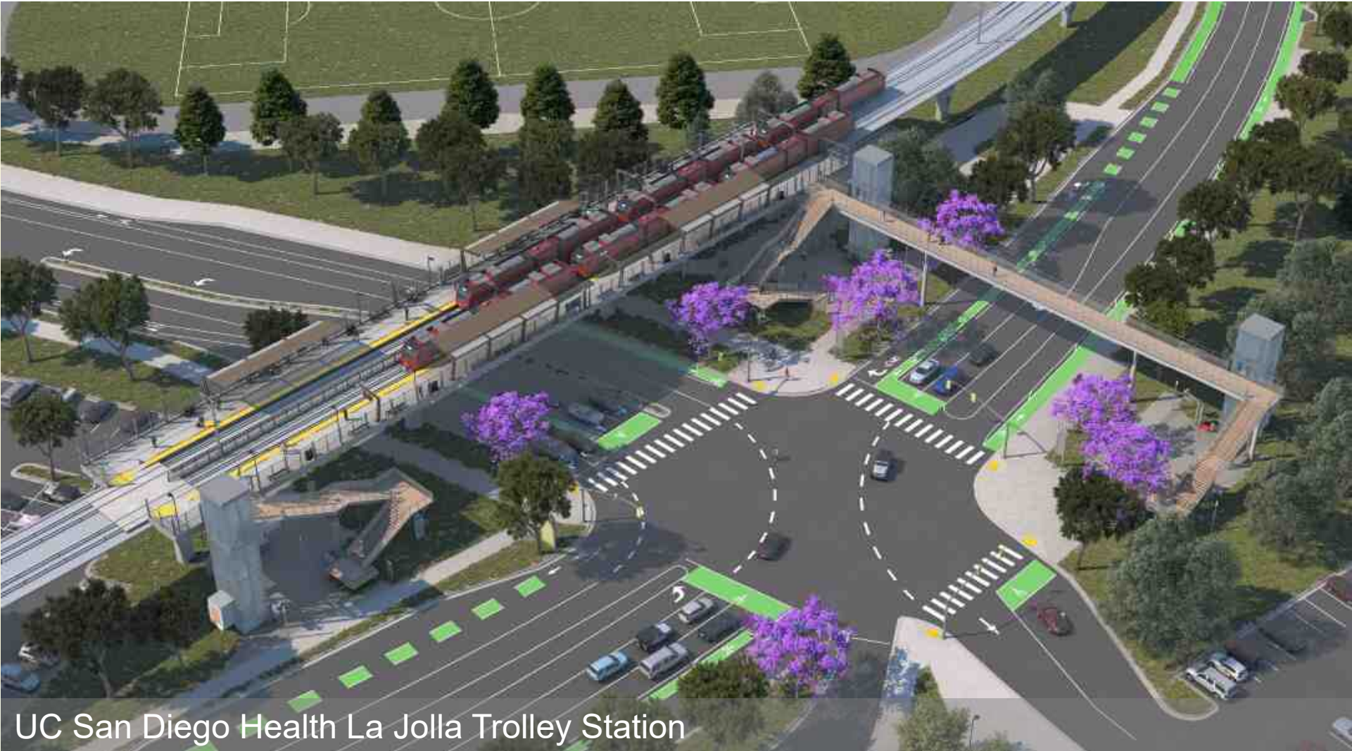
UC San Diego Health La Jolla Trolley Station