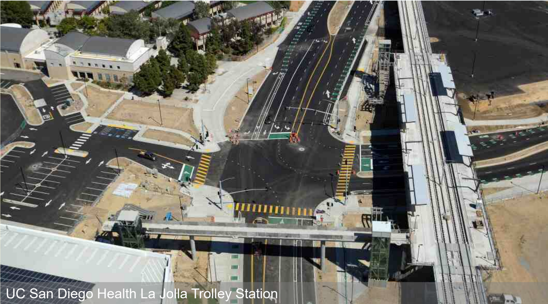
UC San Diego Health La Jolla Trolley Station