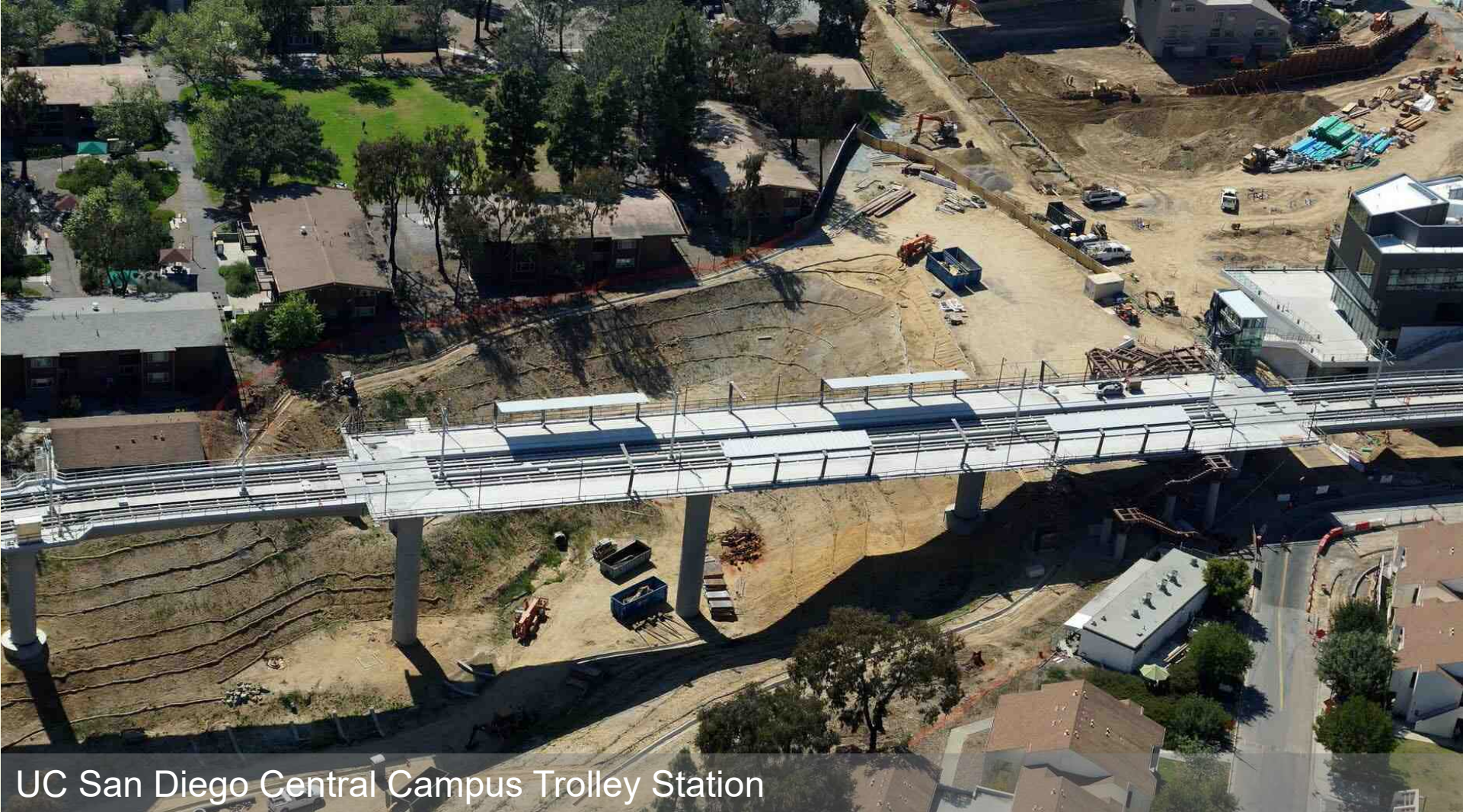
UC San Diego Central Campus Trolley Station