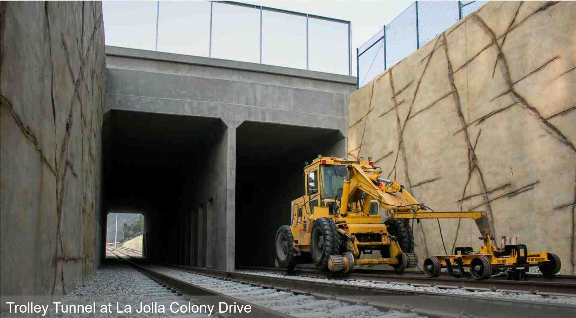
Trolley Tunnel at La Jolla Colony Drive