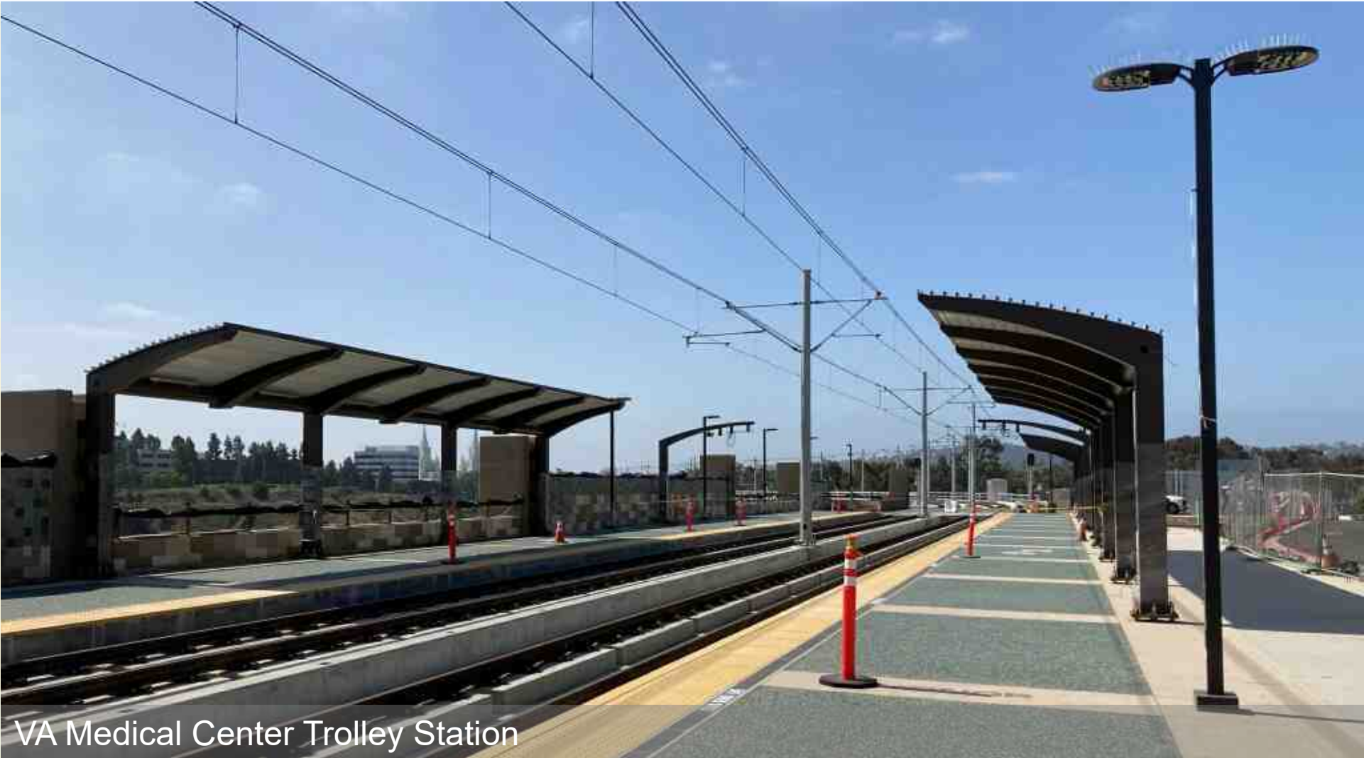
VA Medical Center Trolley Station