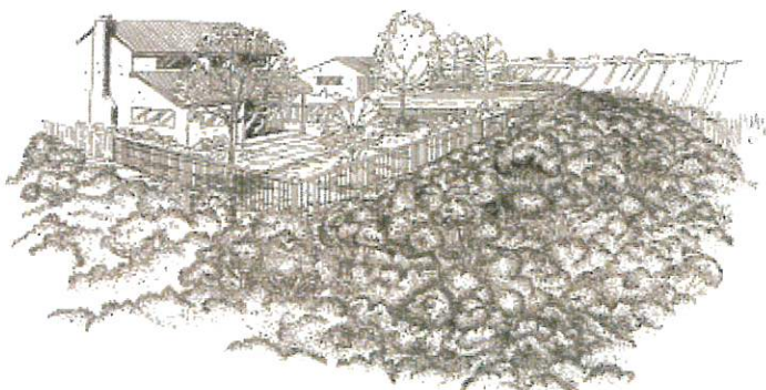
Before Brush Management

Check your local directory assistance or websites for potential landscapers or tree contractors. The Fire-Rescue Department cannot provide or recommend landscape or tree contractors. It is the responsibility of the property owner to assure all brush management work is conducted within the requirements of the City's Brush Management Regulation / City Landscape Regulation 142.042: http://docs.sandiego.gov/municode/MuniCodeChapter14/Ch14Art02Division04.pdf