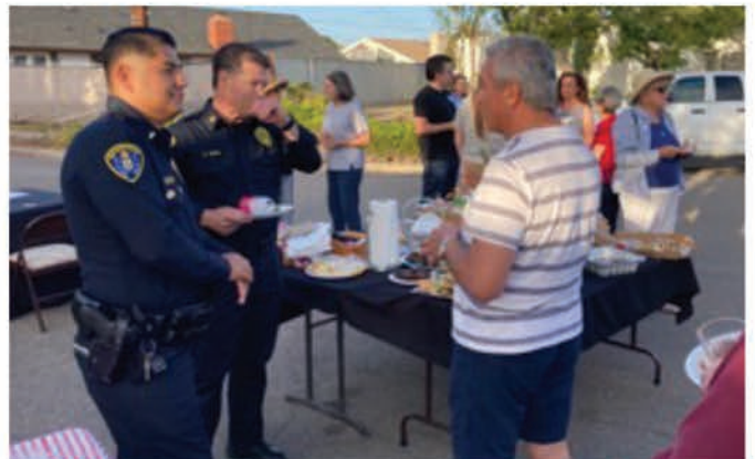
The Quidde/Bloch NNO drew out about 25 neighbors and lots of food!