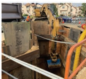
Pipeline construction begins at the intersection of Towne Center Drive and Executive Drive, and this work is expected to continue through mid-September 2022.

Pipeline construction is underway for the Morena Northern Pipelines and Tunnels project, one of several major water infrastructure projects in Phase 1 of Pure Water San Diego. Pure Water San Diego is the City of San Diego's phased, multi-year program that will provide nearly half of San Diego's water supply locally by 2035. Currently, the Morena Northern Pipelines and Tunnels project is underway in University City at the Executive Drive and Towne Centre Drive intersection. To minimize nighttime noise impacts, pipeline installation is expected to occur during the day from Mondays through Fridays, from 7:00am to 5:00pm and Saturdays from 9:00am to 6:00pm and continue through mid-September 2022. Pipeline construction is expected to continue along Executive Drive to the I-805 tunneling shaft at the Executive Drive cul-de-sac. 24-hour traffic control is in effect on Executive Drive from Towne Centre Drive to the Executive Drive cul-de-sac for the I-805 tunneling work.