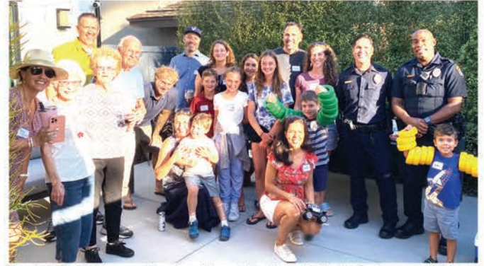
Radcliffe Drive residents attend National Night Out event.

As your District Attorney, I'm committed to increasing communication and accessibility between the DA's Office and the public. I hope these consumer and public safety tips have been helpful. If you have been the victim of elder abuse, report it to Adult Protective Services: (800) 339-4661.