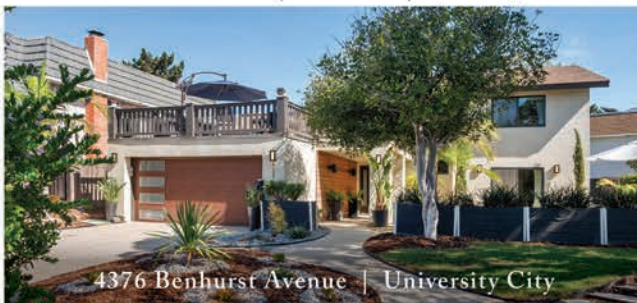
4376 Benhurst Avenue | University City