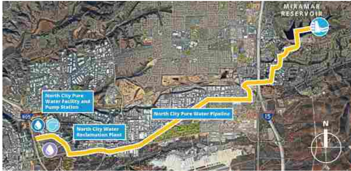
Scripps Ranch and Miramar