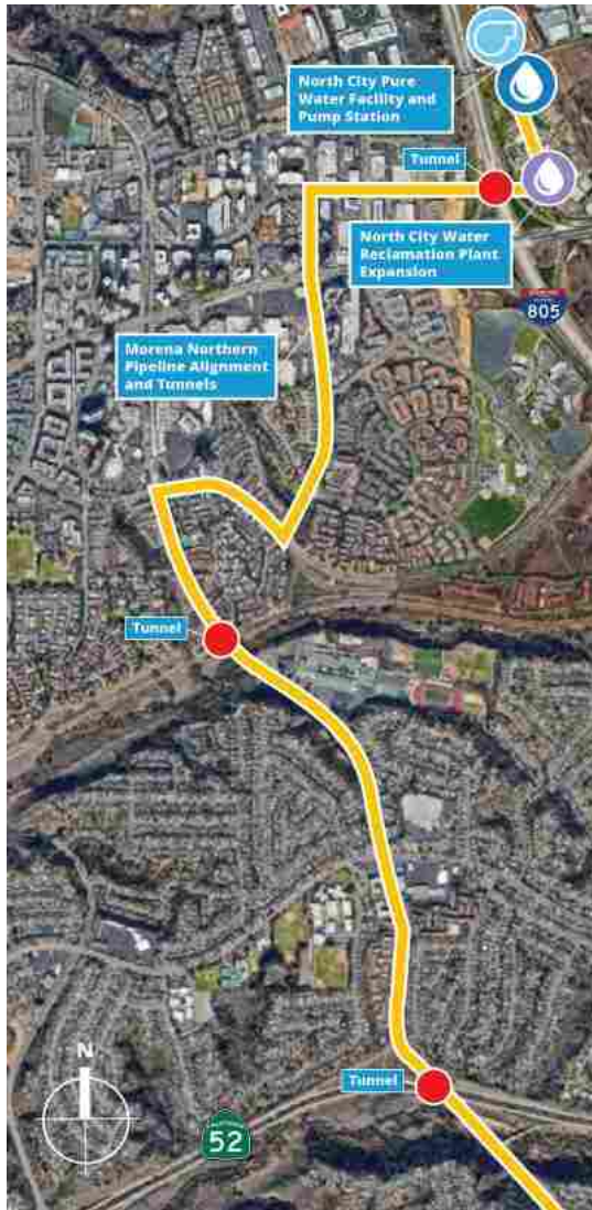
University City and Eastgate Mall