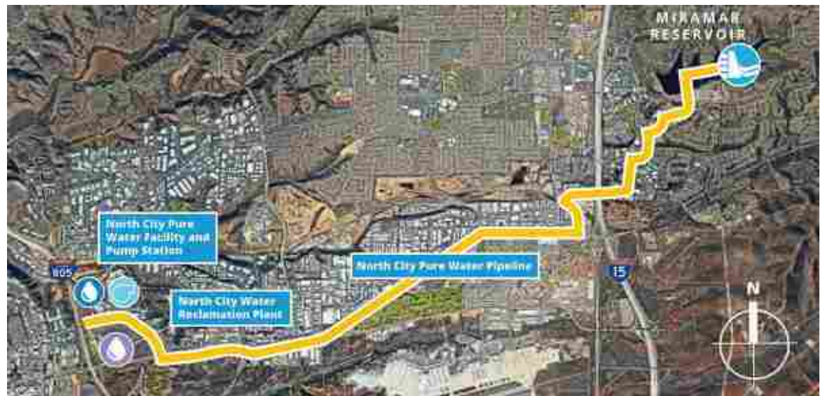
Scripps Ranch and Miramar