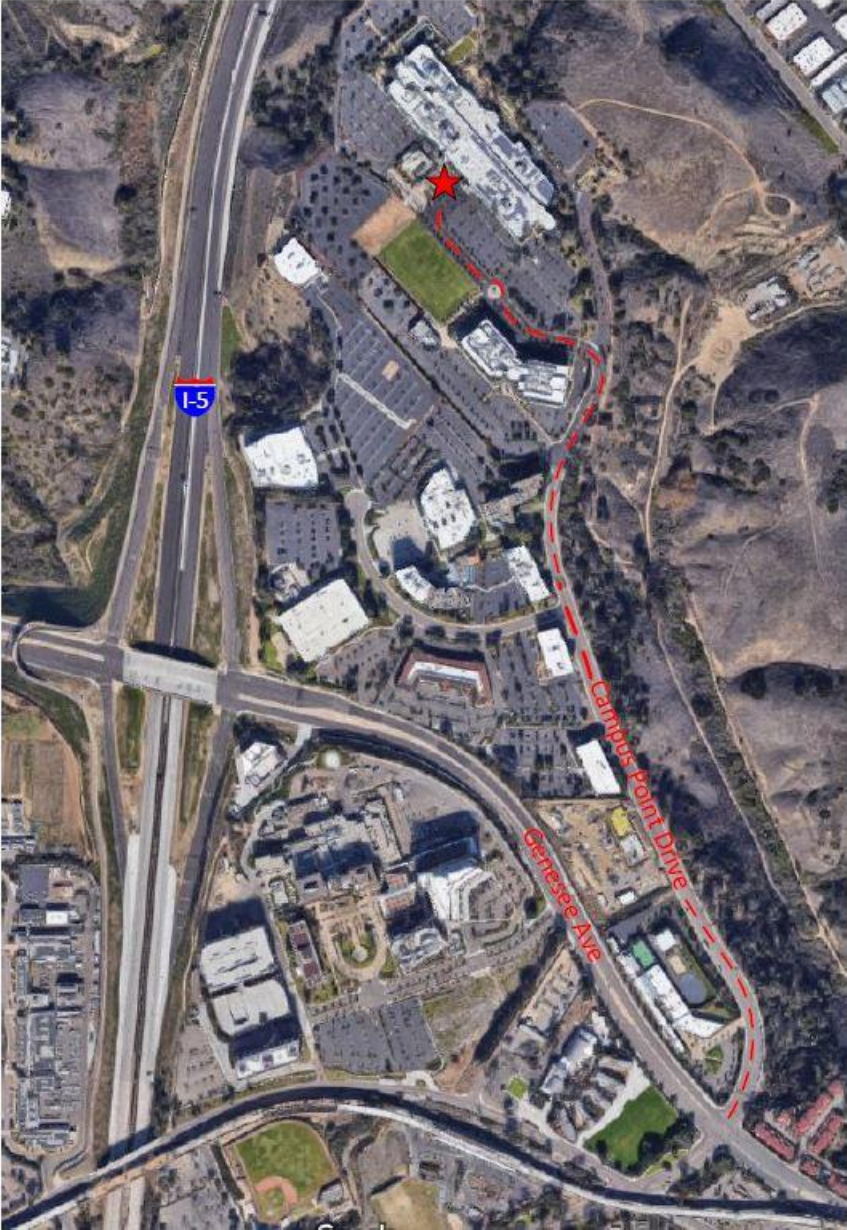
10300 Campus Point Drive

Take Genesee Avenue to Campus Point Drive, veering left at the end.