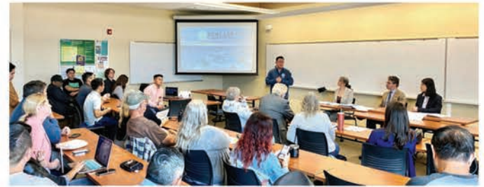
Budget Town Hall

To report a consumer complaint, call 619.531.3507 or email consumer@sdcca.org .